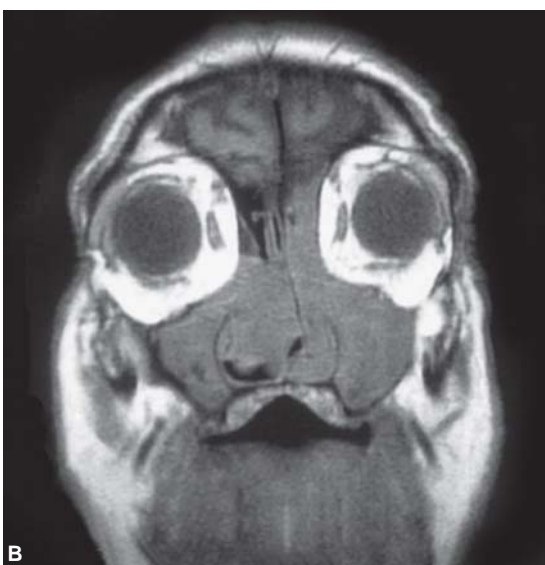
Figs 1A and B: Coronal computed tomography and coronal magnetic resonance demonstrating a left mass occupying the maxillary sinus involving the anteroinferior wall. In the rigth side, we observe a mass limited to the anterior ethmoid sinus

attached to the vertical portion of uncinatus processes and did not involve the maxillary sinus. During the surgery, it was assessed that no communication existed between the right and left side, confirming the bilateral independent lesions.